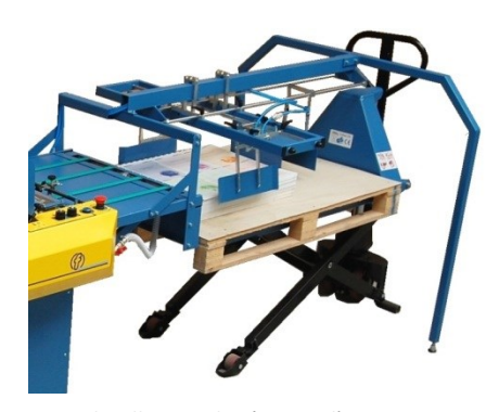
Optional Pallet Stacker(manual)